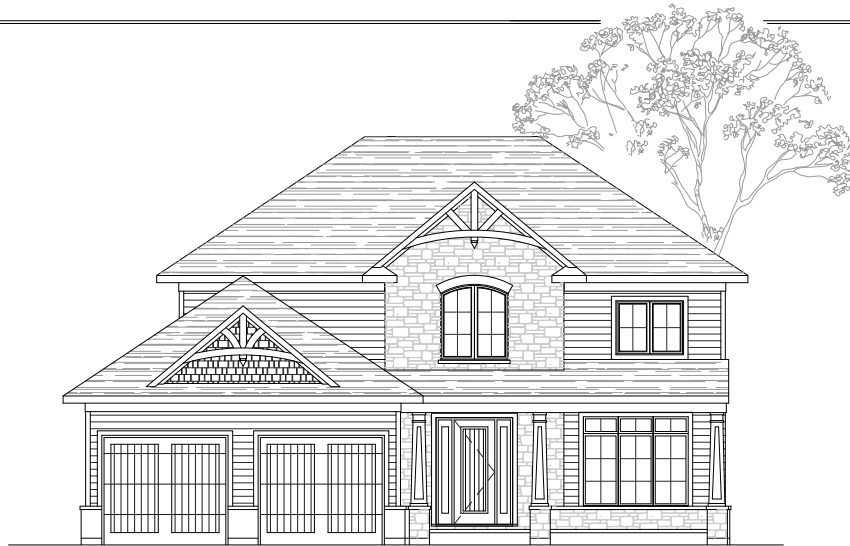
ELEVATION 2085 SQFT