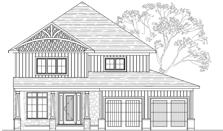
ELEVATION 2192 SQFT