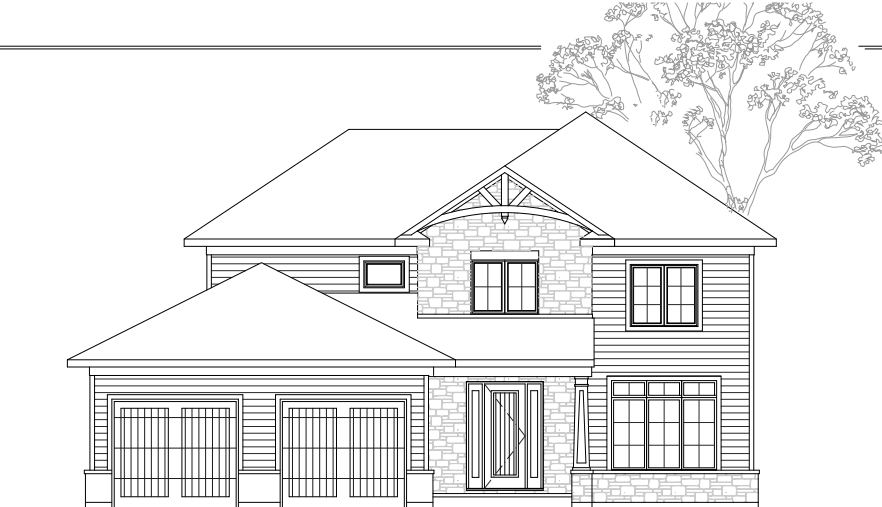
ELEVATION 2368 SQFT