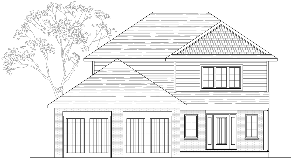
ELEVATION 1831 SQFT